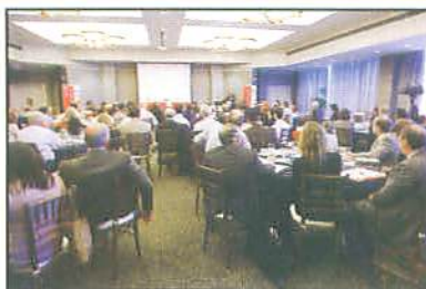
An at-capacity audience of healthcare industry executives, government officials, medical practitioners, and scholars.